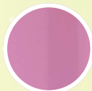
Pink PMS 210 C