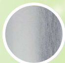
Aluminium No paint