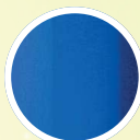
Transparent blue PMS 287 C