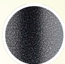
Aluminium No paint