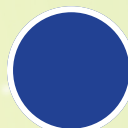
Fuel UE PMS 288 C