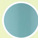
Light blue PMS 630 C