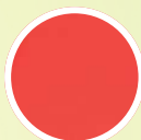
Fuel red PMS 1795 C