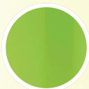
Green PMS 376 C