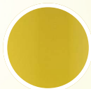
Yellow PMS 116 C