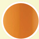
Orange PMS 1585 C